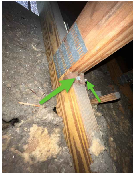
Clips 3 Nails