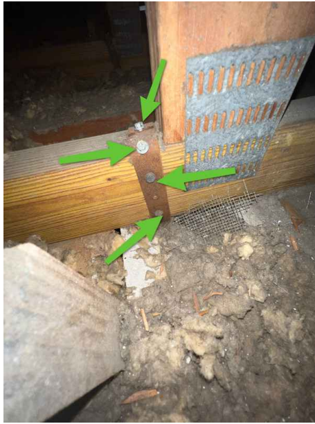
Clips 3 Nails