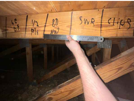
Spacing and Information